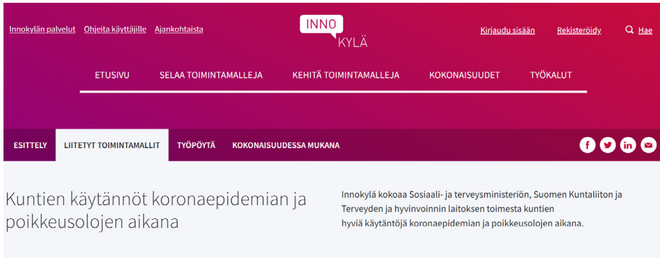
Picture 2. The view of the INNOKYLÄ webpage (Ministry of Social Affairs and Health, the Finnish Association of Local Authorities and the National Institute for Health and Welfare). Users can add content on good initiatives and models. The following page was dedicated to COVID-19 related examples for activities for children and youth. Screenshot taken 3.1.2022.

To enhance children and young people's right to meaningful leisure activities, including hobbies. The Finnish model for leisure activities was implemented by the Ministry of Education and Culture in 2021 during the pandemic. The project provides funding for municipalities to offer free leisure activities based on the recreational aspirations of children and young people. Activities occur in and around schools, during or immediately after school hours, organised by local sports clubs, arts and culture organisations, youth organisations, municipal authorities, and other actors. The Finnish model aims to ensure that every child and young person has access to hobbies, regardless of family background or place of residence. (OKM 2020b).