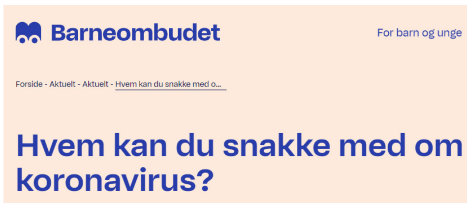
Picture 3. The view of Norway’s Ombudsperson for Children’s webpage . The following page gathers helplines where children and young people can talk to about the coronavirus. Screenshot taken 3.1.2022.

The Ombudsperson for Children in Norway dedicated a page on its website addressing issues such as who can children and young people talk to about the coronavirus (in Norwegian), with useful resources and helplines.