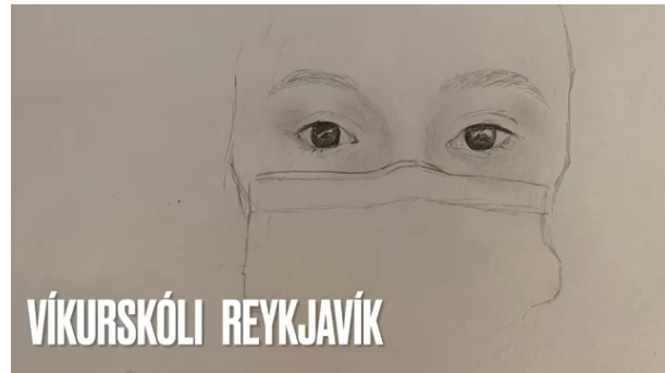
Picture 4. The view of Iceland's Ombudsman for Children's webpage. The following page gathers children's stories about corona virus in Iceland. Screenshot taken 9.1.2022.

Our interviewees agreed that children's voices were not sought during the arrangements made in response to the pandemic. Within the municipalities, primarily through youth councils, young people are consulted about many issues, but not at higher policy levels. Children and teenagers were, however, always actively participating in the decisions. However, they were not consulted on how to use the government's additional funding due to the pandemic. New measures are gradually being taken to implement children's rights and listen to their views. In the future, it is important to develop such distant leisure activities which work well for children. Furthermore, there has been an increase in young people's formation of groups